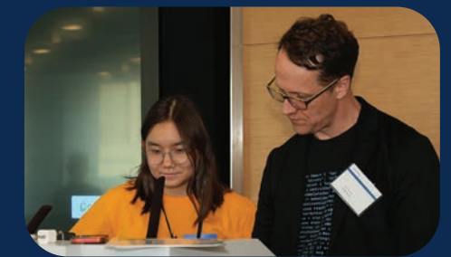
Coding Club for elementary school students at PS 78, in action through our partnership with Morgan Stanley.