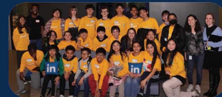
LinkedIn hosted a dynamic speed mentoring event.

Opportunities can fit any schedule, from one-time activities to ongoing support. Volunteers inspire students and help them grow into leaders who return to guide others. Donors make this cycle possible, enabling programs that empower young people and strengthen communities for generations to come.